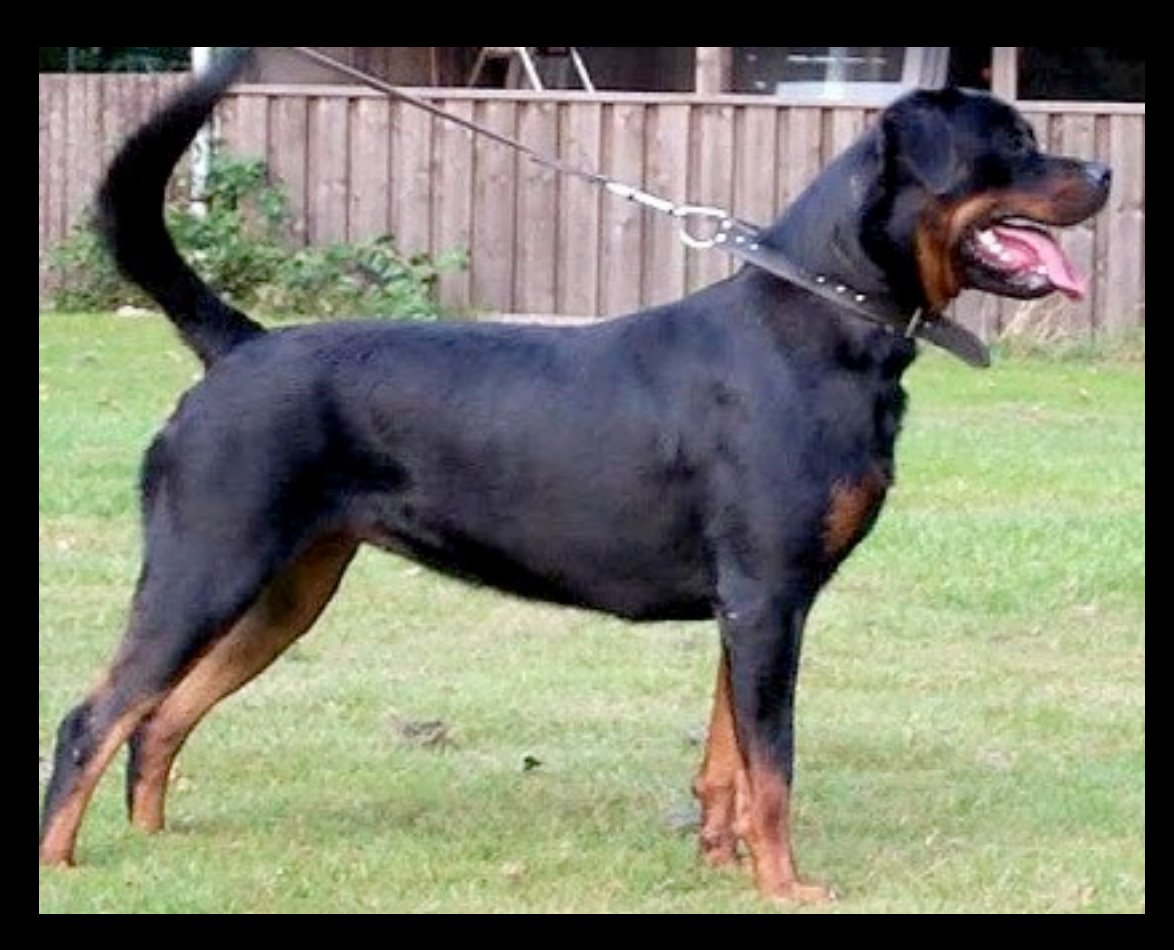
There has to be an end of some kind.

How did this happen to me? I was the one on the SOC arguing that we shouldn't have a summary.